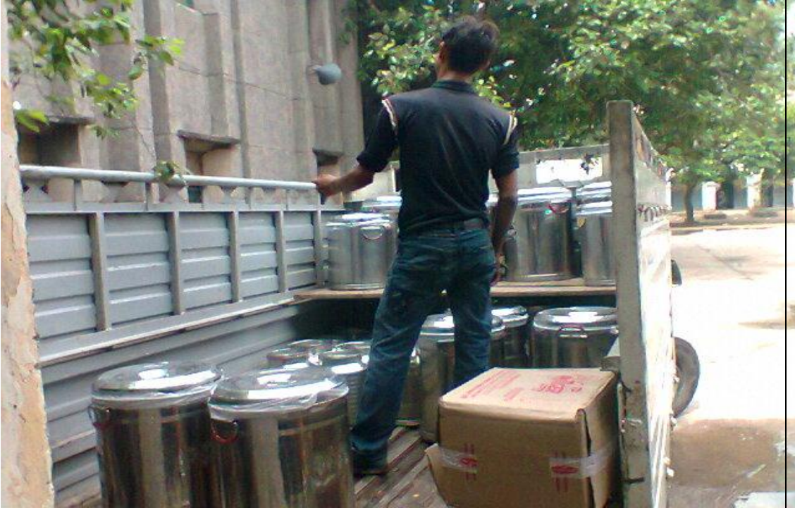
Snap-Supplier was supply meal (Puri sabjee) alogwith Biscuit at SBV kalyanpuri on 7.8 2012. Table-6 Meal shortage in Schools on the day of MI visit

In 8(40%) DOE schools principals and MDM in-charges informed that quantity of MDM received from suppliers was short for 3-4 days in the last 2 months. In 6(30%) DOE schools received adequate quantity of meals. When short, 3(15%) have made alternative arrangements for the day while informing suppliers' kitchen managers of received shortage. These incidents have been uncomfortable for children. Despite said alternative arrangements some have had to remain hungry.