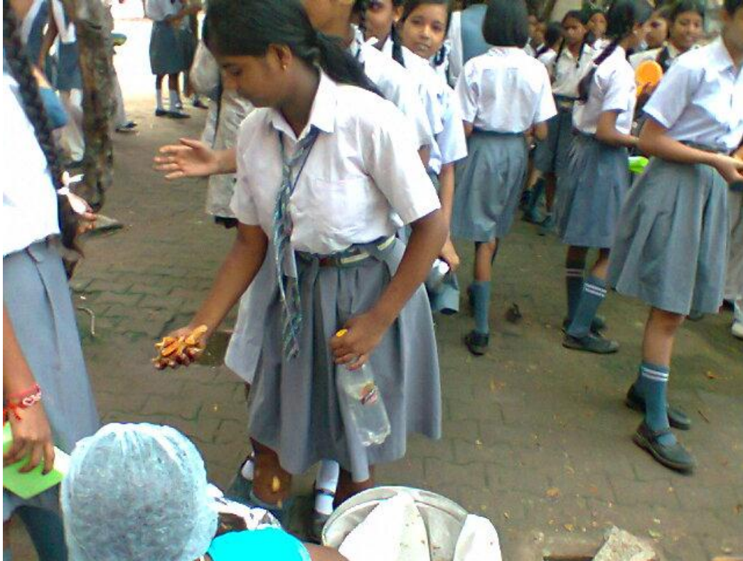
Snap-Mid day meal was shortage on MI visit day at SKV J& K Block, Dilshad garden, New Delhi

In 5(25%) DOE schools principals and MDM in-charges informed that quantity of MDM received from suppliers was short for 3-4 days in the last 2 months. When short, 3(15%) have made alternative arrangements for the day while informing suppliers' kitchen managers of received shortage. These incidents have been uncomfortable for children. Despite said alternative arrangements some have had to remain hungry.